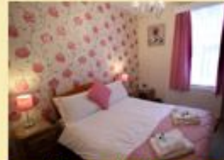
Ground floor double en-suite