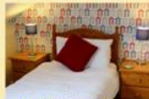
Loft single/twin en-suite