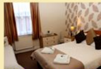
Triple room en-suite