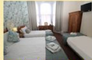
Large family room en-suite